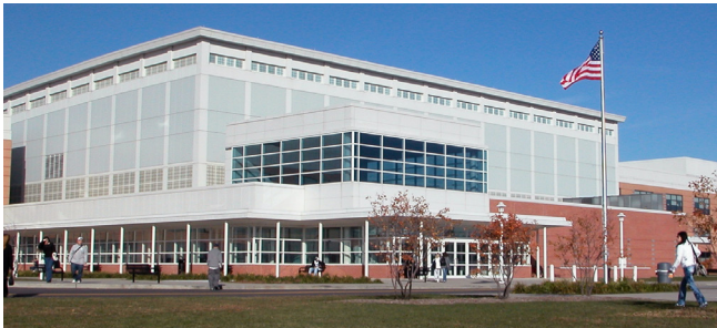
Michael J. Grant Campus