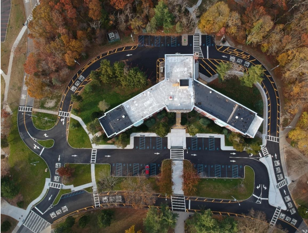
Ammerman Campus ADA Access and Parking Improvements