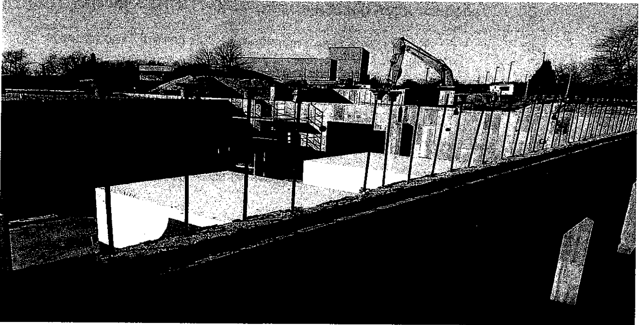
Foundation walls, HVAC units for the new Learning Resource Center on the Grant Campus