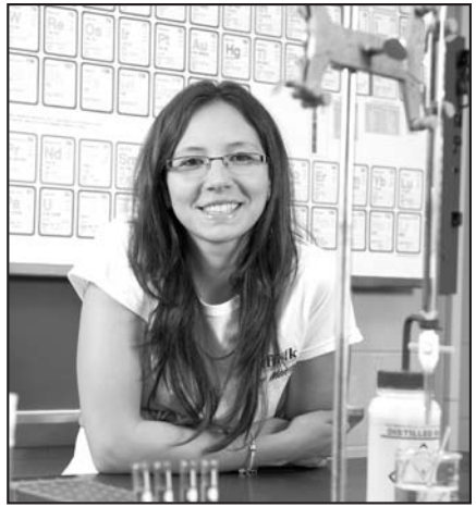
SCCC has a long history of producing award-winning science students.