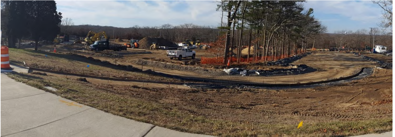
Ammerman Campus - Parking Upgrades