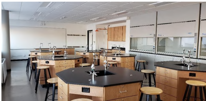
Grant Campus - Sagtikos Bldg. Renovation