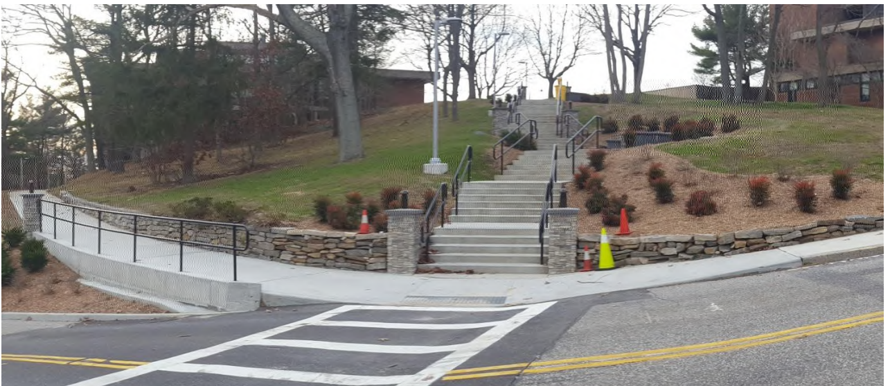
Ammerman Campus - New Entrance to Veteran's Plaza