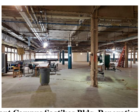
Grant Campus Sagtikos Bldg. Renovation