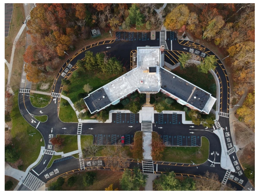
Ammerman Campus ADA Access and Parking Improvements